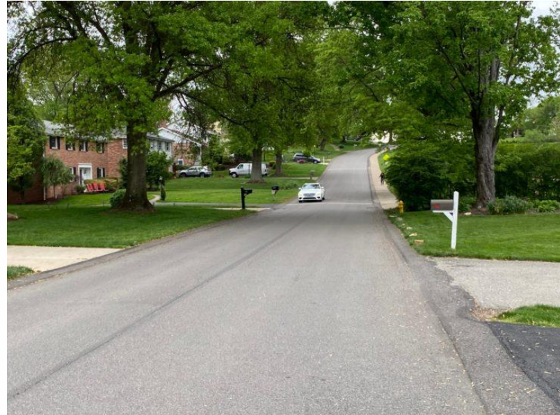
Institute for Transportation and Development Policy