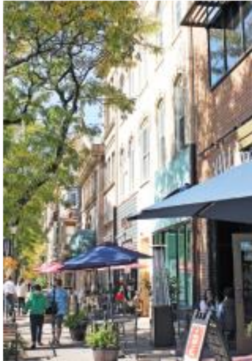
Creating Great Places to Age in New Jersey