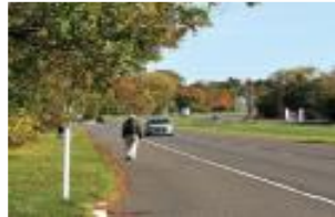
Creating Great Places to Age in New Jersey