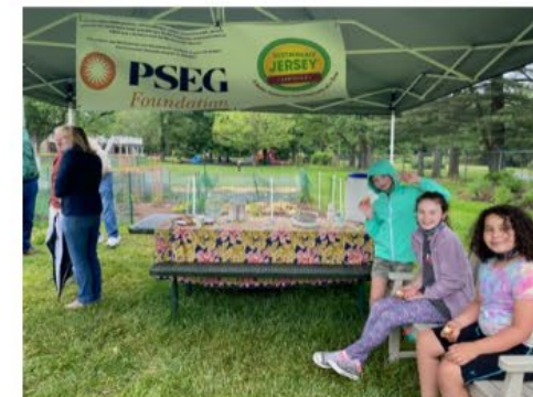
Our community event with over 30 attendees (including Mayor) introducing improvements & educating residents