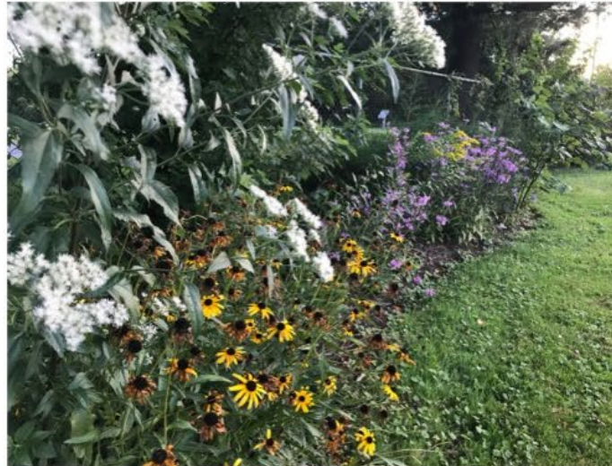
A 7' X 50' native pollinator hedgerow, deflects run-off from the local golf course, increases wildlife habitat and biodiversity, and helps our community garden grow and thrive