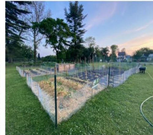
Two 10' X 20' IE vegetable garden beds and a 3- bin composting system, broadens the Merchantville Organic Community Garden's impact