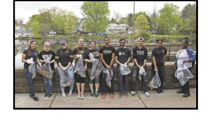
Hightstown Borough Stream Clean Up

Notifications will be made by January 25