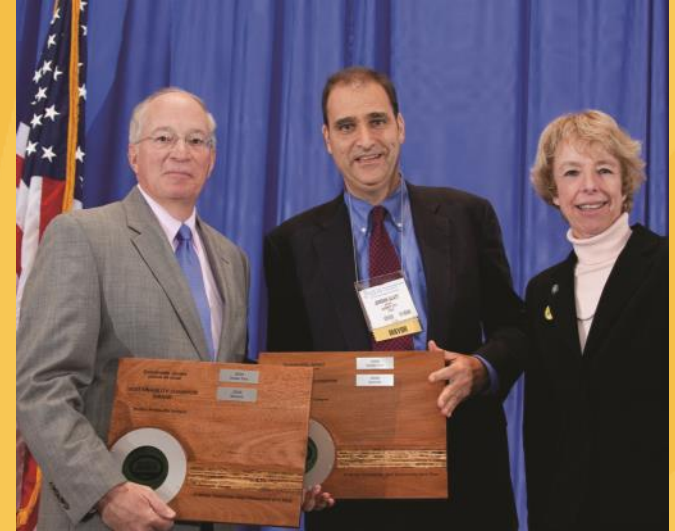
Sustainability Champion award goes to Summit