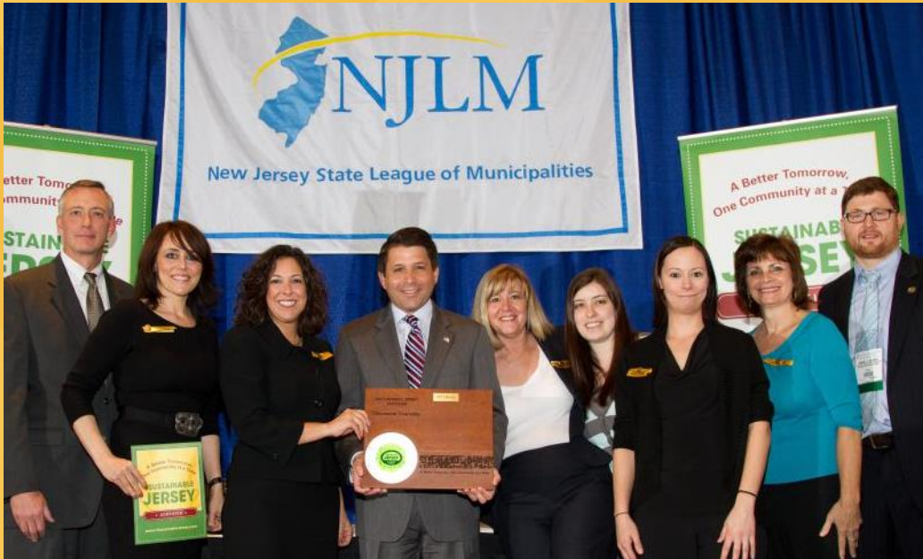
Gloucester achieves Sustainable Jersey certification