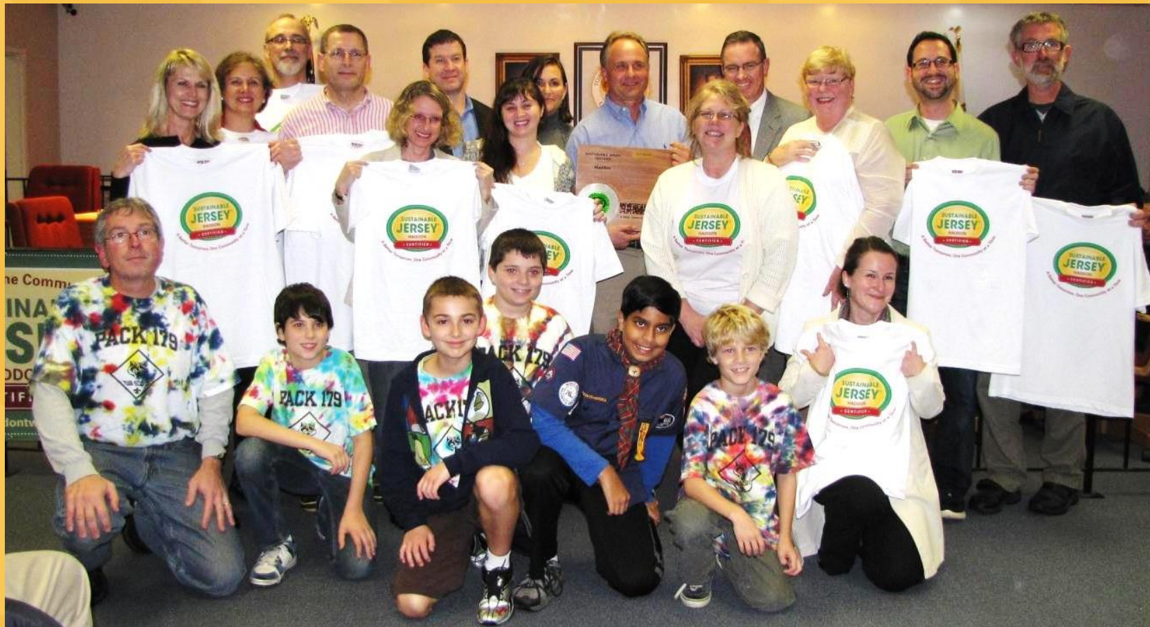
Haddon Township celebrates achieving Sustainable Jersey certification