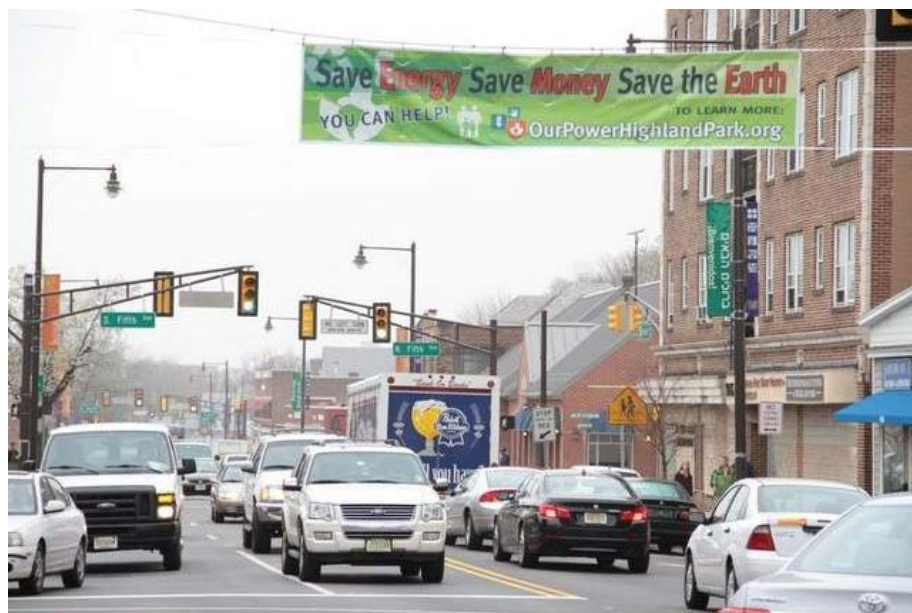
Members of the community were asked to take the borough's "It's in Our Power Highland Park" campaign pledge to cut energy usage and create a cleaner, healthier environment. During Wednesday's event, a banner highlighting the program was unveiled across Raritan Avenue.