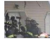
Fire in Multifamily structure in Avenel