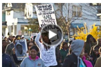
March for Justice (3/29/12) Mar 30, 2012