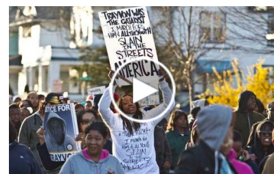
March for Justice (3/29/12) Mar. 30, 2012