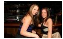
Toast of the Town visits Rhythms of the Night