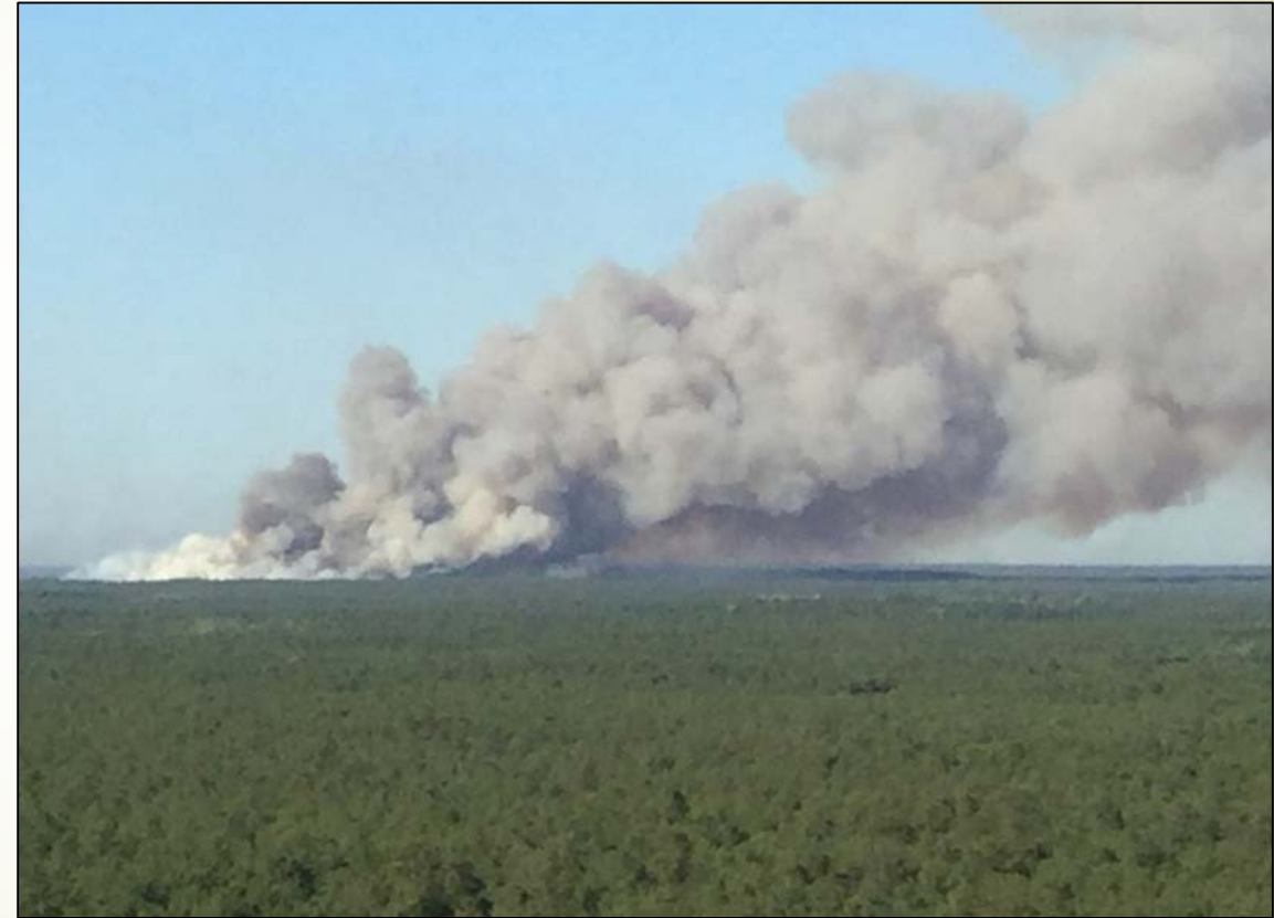
Section B3, Woodland Twp- Butler Place Wildfire 06/12/16 357 acres - As seen from the Apple Pie Hill fire tower.