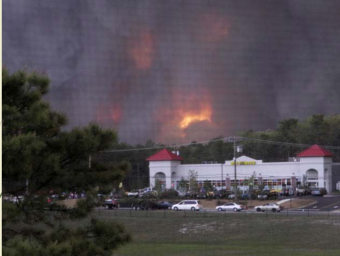
Warren Grove Wildfire, May 2007 17,000 + acres